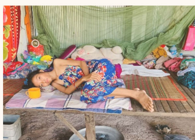
A daughter with chronic illness

They also borrowed money from various sources, but their financial situation did not improve. The family's three children are working in a factory to earn money to pay off debts and cover their living and medical expenses. In April, one of their daughters passed away due to a chronic illness, further exacerbating their financial and emotional struggles. Hopefully, the support provided this time will alleviate their immediate hunger, and efforts are underway to find additional ways to assist the family in getting back on their feet.