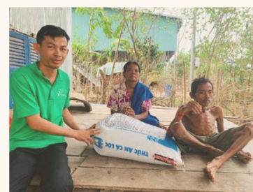
Food Aids supported from CAO staff foundation.