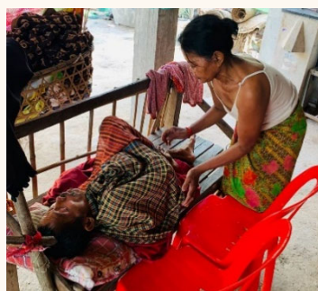
The wife is taking care husband.

A very sad, poor household living in Chrung Por Pel Commune faces numerous challenges. The daughter has passed away, leaving behind a husband who is experiencing a mental health crisis. Additionally, the family is burdened with significant debt from banks and the private sector, with high interest rates. The CAO staff foundation has decided to help this family by providing them with a portion of rice for their consumption and offering some financial support. In the past, this family had a positive working relationship with the CAO project, but things took a turn for the worse when the husband began experiencing psychological issues. Despite investing time and money in treatment, the situation did not improve. The wife tried to manage their paddy rice farm, but the expenses related to treatment outweighed the results.